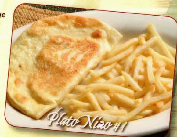
Plato Niño #1

NOT RESPONSIBLE FOR LOST OR STOLEN ITEMS LEFT AT TABLES.